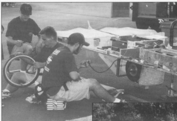
Getting ready for the race.